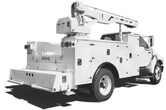
Shown with optional crane, bumper and manual outriggers.